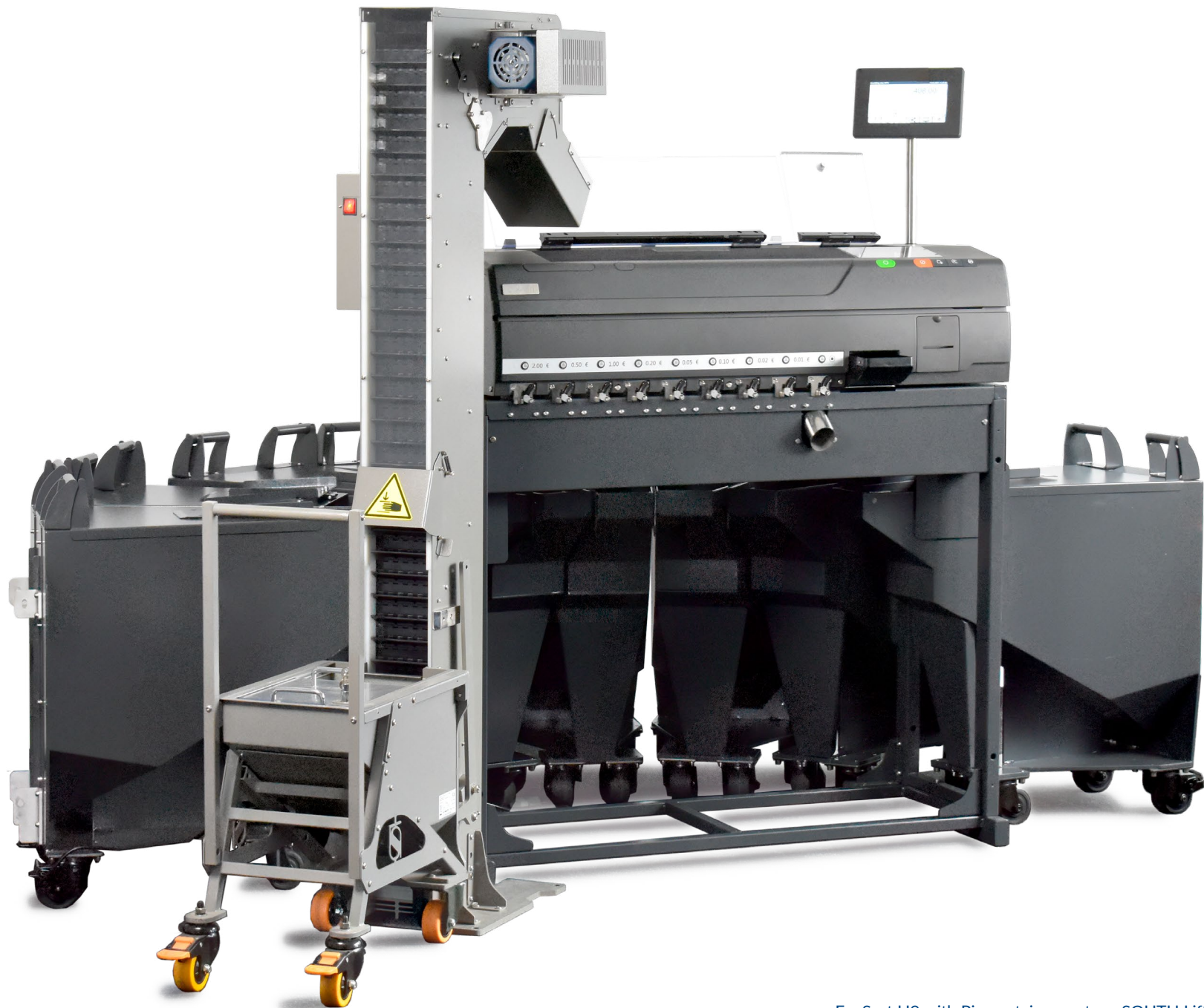
EvoSort H9 with Pie container system, SOUTH Lift-coin and Container L