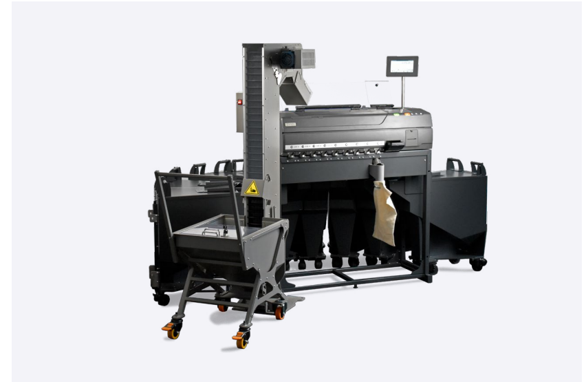
EvoSort H9 with Pie container system, SOUTH Lift-coin and Container XL

The containers can be individually moved without the need of extra tools.