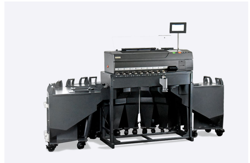
EvoSort H9 with Pie container system