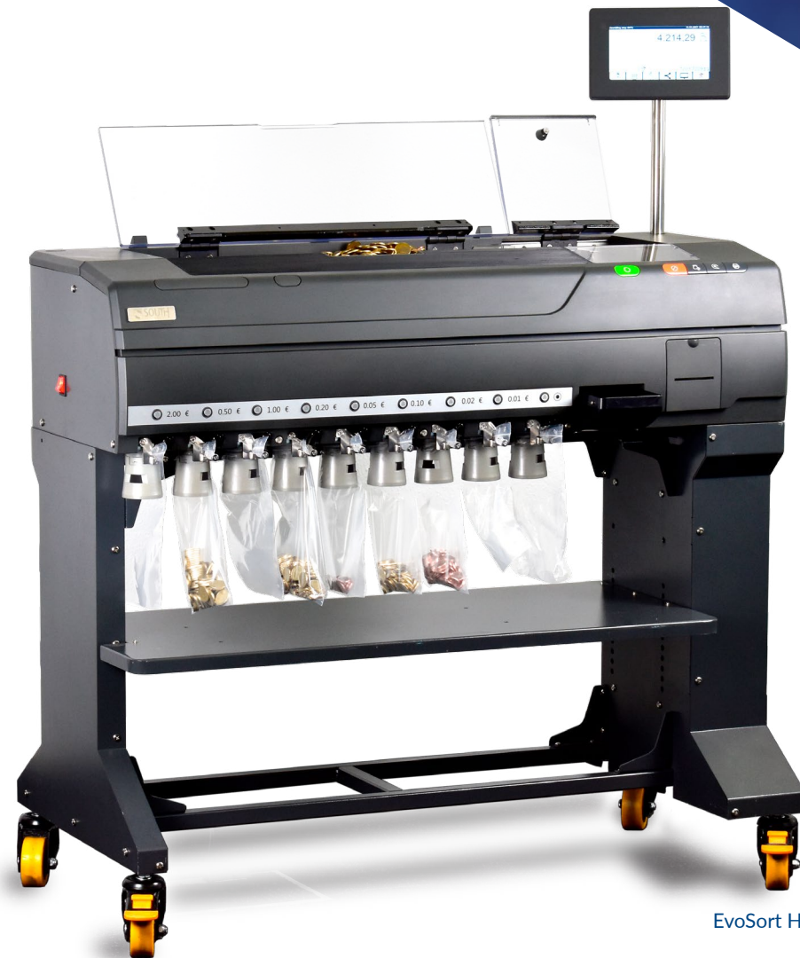
EvoSort H9 with design stand

High throughput, ideal ergonomics and the right flexibility to integrate into your cash center without alterations to your sorting stations. Our latest coin sorter EvoSort H9™ combines all major requirements for medium and high volume sites.